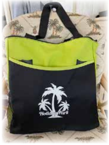
2-Tone Tote Bag $15