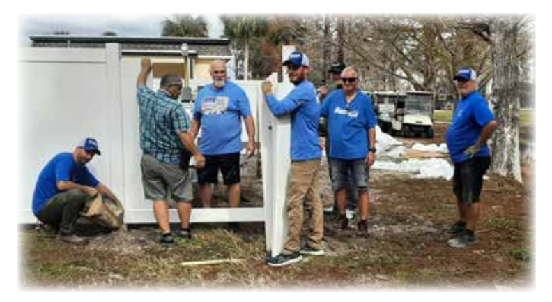
(Maintenance Staff & Men's Club members putting up new fence around PH 2 Pool Pump House)

As the season is in full swing, please ensure you are following the rules and regulations at the pool and common areas.